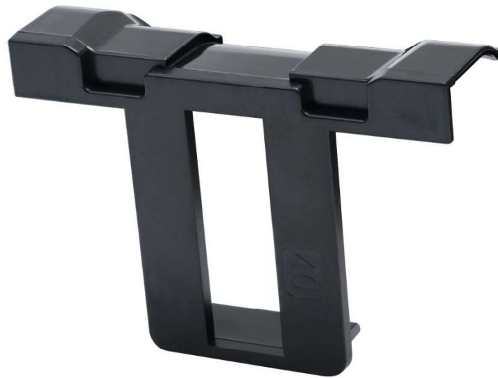
Plastic drainage clips

2, made by Plastics, with service life of 7~8 years, Plastics drainage clips also has two specifications, one is the surface with a hydrophilic coating , and the other does not.